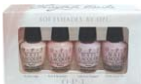
FAIRYTALE BRIDE MINIS

Includes 1/8 Fl. Oz. each: I Pink I Love You Otherwise Engaged, At First Sight, Isn't It Romantic?